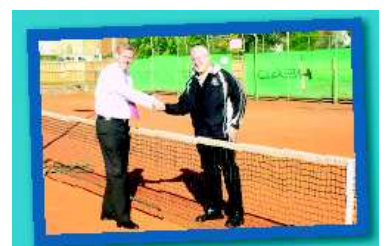
BURWOOD TENNIS CLUB SCORES WATERWISE WIN